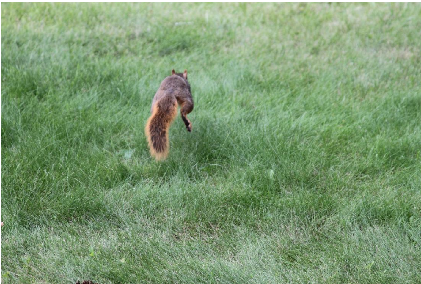
Photo Caption: Squirrel running away in the grass (private land in Montana)