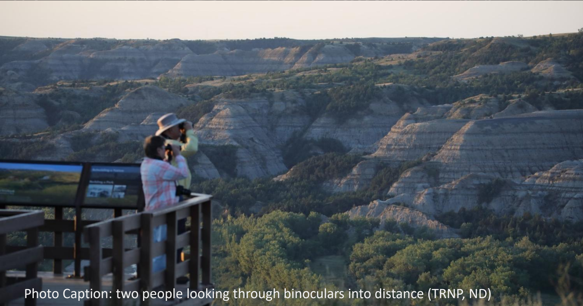
Photo Caption: two people looking through binoculars into distance (TRNP, ND)

Starting fresh – Case Study by Laria Lovec