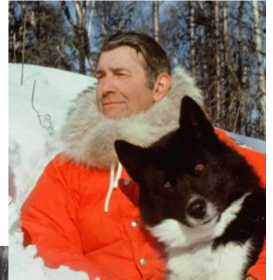
Joe Redington Sr