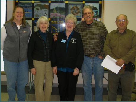
Governing Body Members