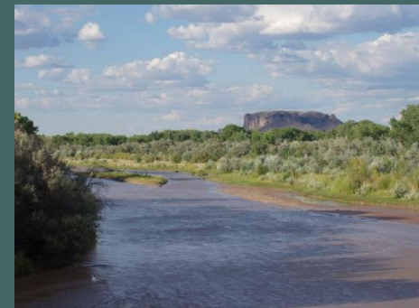
Contract & Consulting