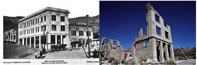
The Cook Bank Building, 1908 (left) and 2009 (right)