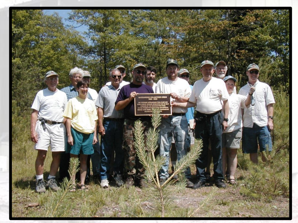
2002 dedication of the Massanutten National Recreation Trail