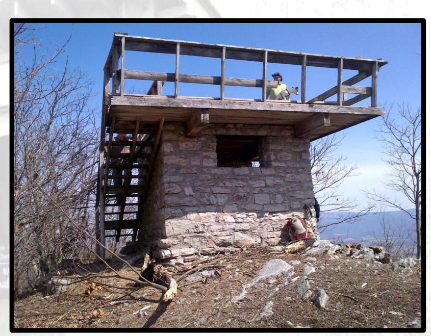
Kennedy Peak Tower